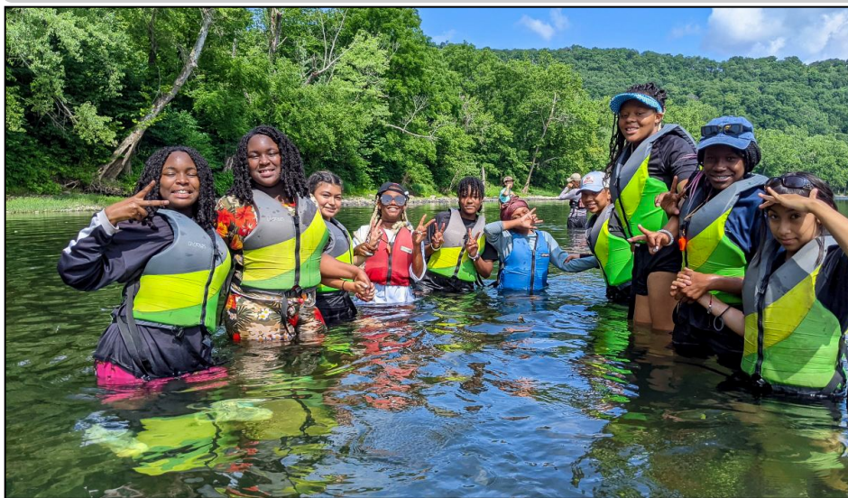
Eighth-graders enjoyed a brief "cool-off" before continuing down the Potomac River.

Through a grant provided by the Knott Foundation, Outward Bound continues to partner with Sisters Academy to provide students, faculty, and staff with