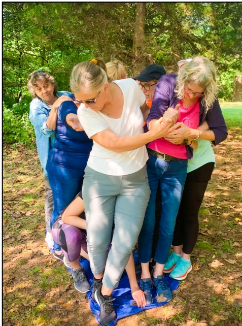
Faculty needed teamwork for this exercise.

As Sisters Academy welcomes fall, additional Outward Bound experiences await our 6 th , 7 th , and 8 th grade students.