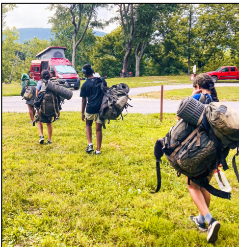
Each student carried camping gear and necessities on this outdoor adventure.

that they are stronger than they ever imagined individually and that they can accomplish much more when they work together.