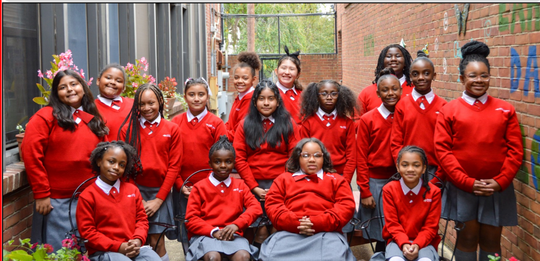
The students of the Class of 2026, our 19th fifth-grade class, pose for their class picture.

We carry our gifts on the wings of grace is the theme for 2022-2023, our 19th school year.