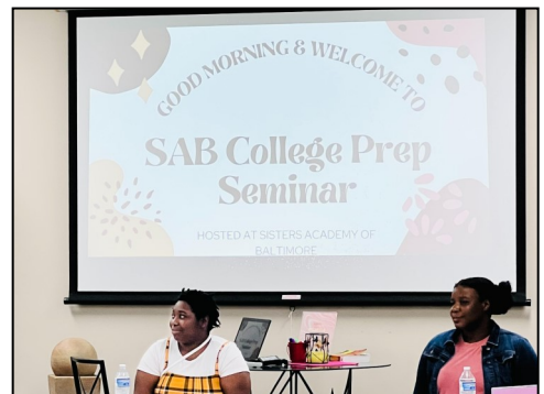
Two of the SAB graduates on the panel

choice of a college; to learn about the application process for college and for financial aid; and to consider the student's financial obligations while at college and beyond. Representatives from area colleges, including Loyola University Maryland, Stevenson University, Notre Dame of Maryland University, Delaware State University, Bowie State University, McDaniel College, University of Maryland, and University of Baltimore participated in the sessions and stimulated discussion and questions. As the week came to a close, five SAB graduates who are now in college shared their experiences of