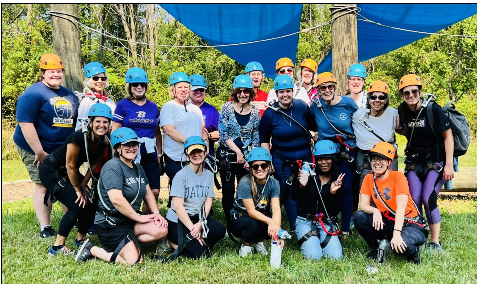
Everyone got to don a hard helmet for the various individual and teamwork exercises.

These new experiences will provide an opportunity for personal growth and strengthen the bonds of sisterhood.